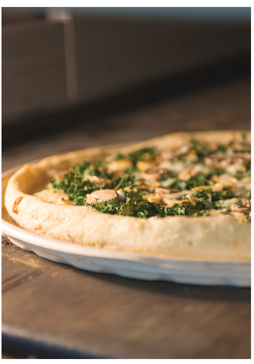
The North Coast Co-op Deli bakes a kale and mushroom pizza in the oven, one of the new items in the expanding deli.

If you have questions or comments regarding the remodel, don't hesitate to contact me at (707) 822-5947 ext. 220 or gm@northcoast.coop.