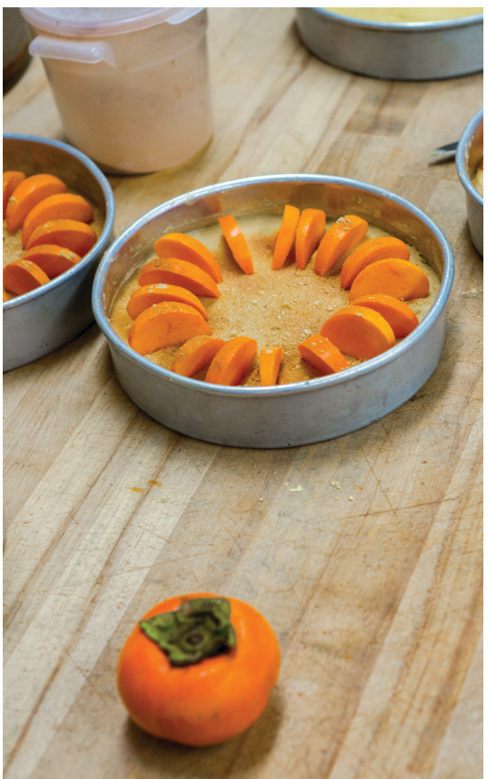
"You don't realize how cool it is to have a bakery that makes everything from scratch until you tell a room full of hungry people that you know how to make custard eclairs and lemon bars." —Charlie, Senior Clerk/Baker